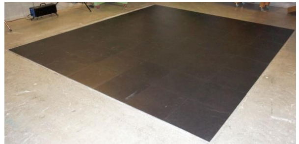
Test specimen installed in laboratory for test.