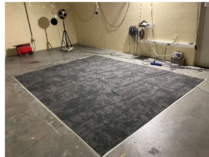
Photo: the perimeter of the sample is covered with a non sound absorbing tape.