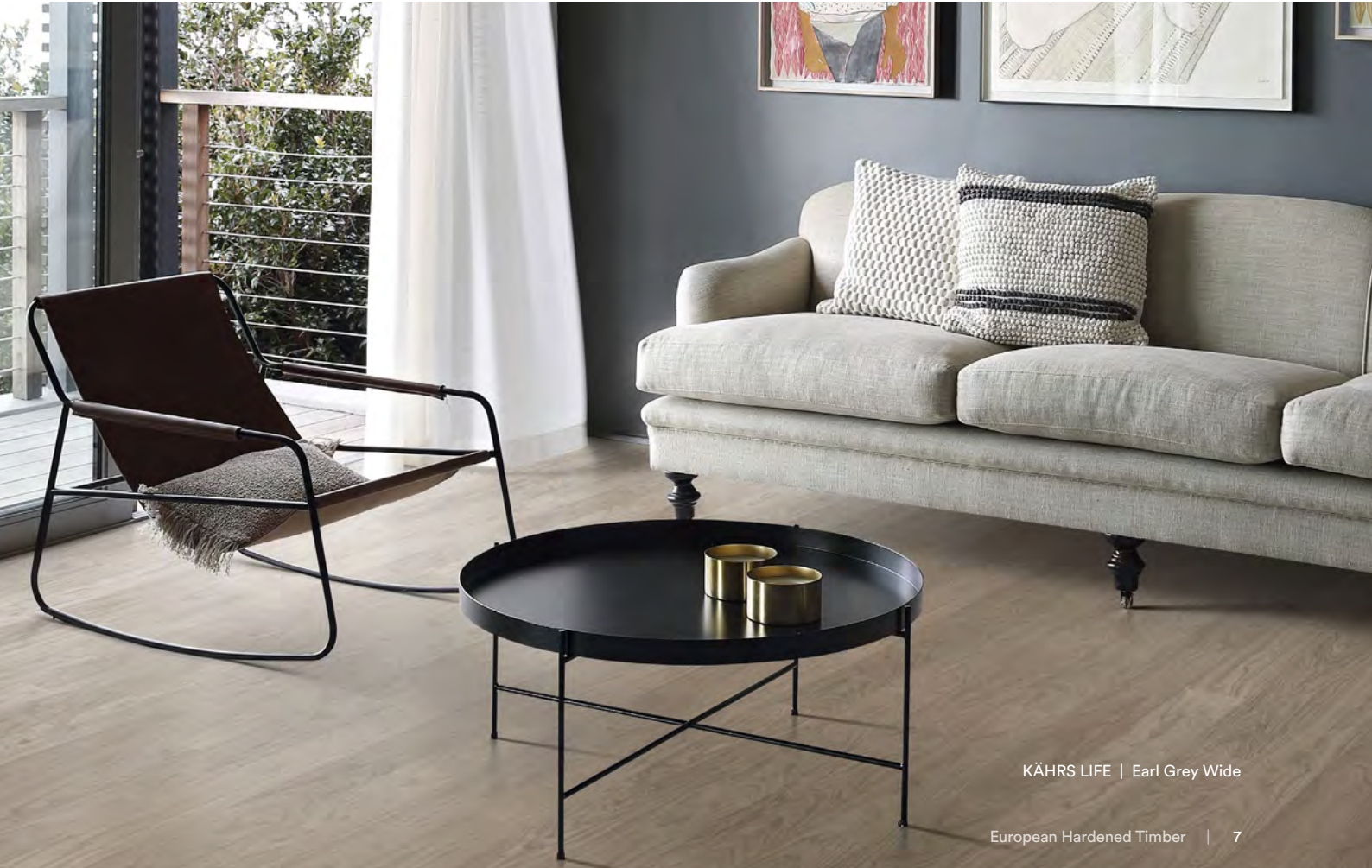
KÄHRS LIFE | Earl Grey Wide