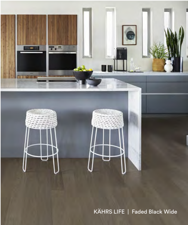
KÄHRS LIFE | Faded Black Wide