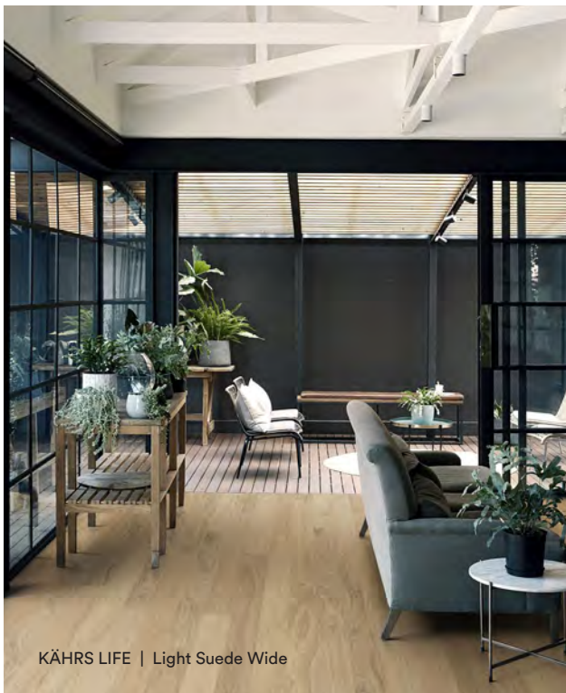
KÄHRS LIFE | Light Suede Wide