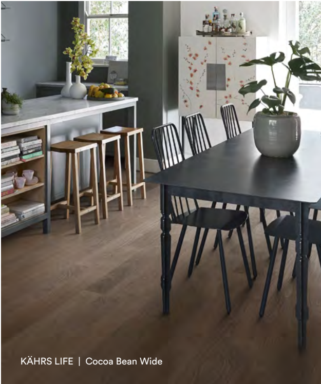
KÄHRS LIFE | Cocoa Bean Wide