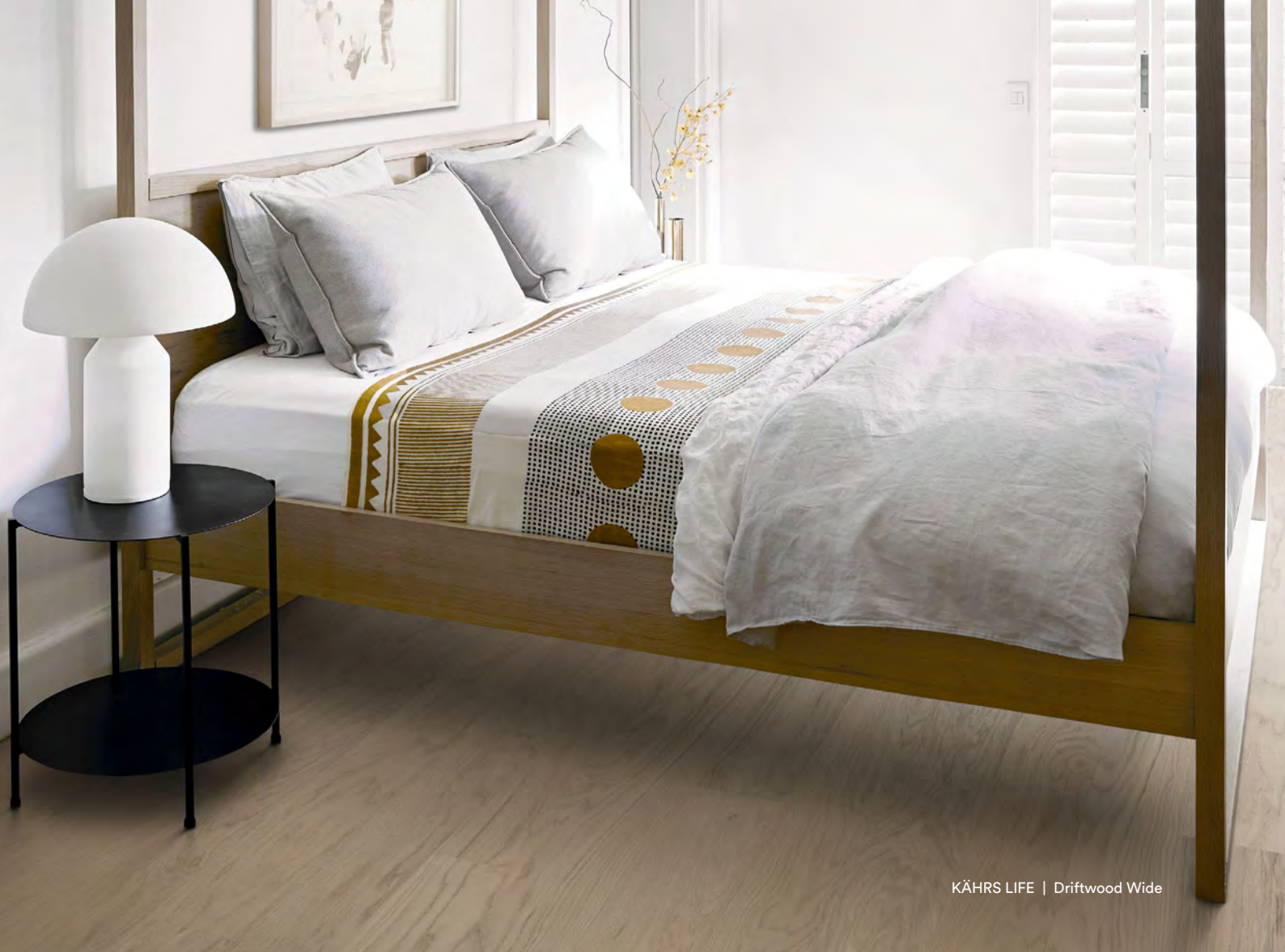
KÄHRS LIFE | Driftwood Wide