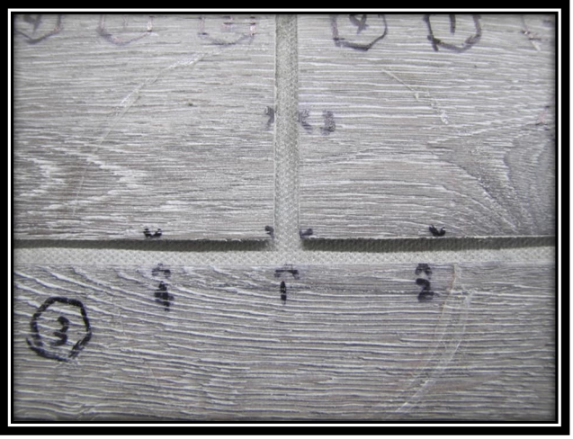
Recovered Swell (Disassembled)

"THIS REPORT APPLIES ONLY TO THE SAMPLES TESTED"