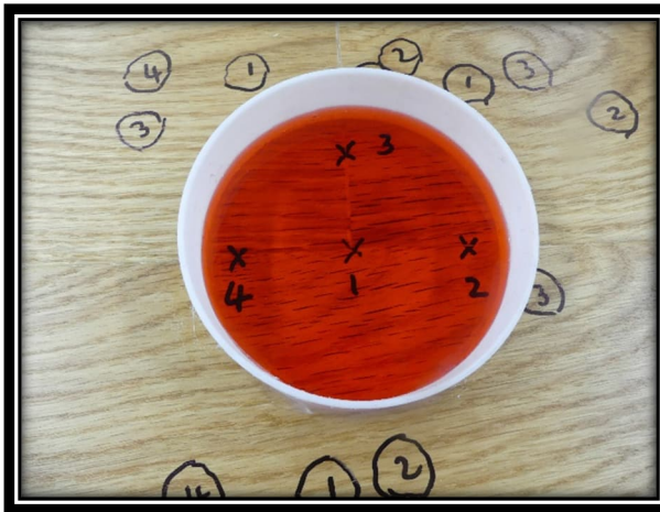
After 24 hrs With Water