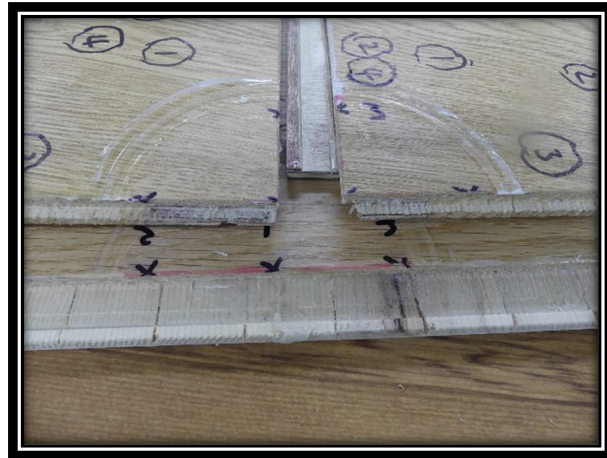
Recovered Swell (Disassembled)

"THIS REPORT APPLIES ONLY TO THE SAMPLES TESTED"