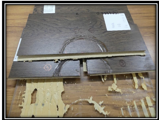
Recovered Swell (Disassembled)