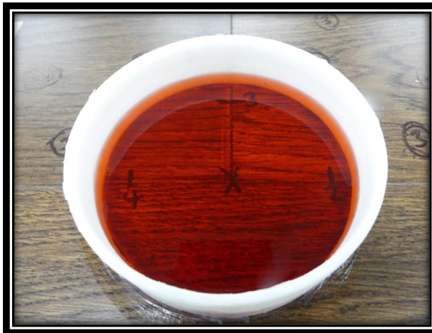
After 24 hrs With Water