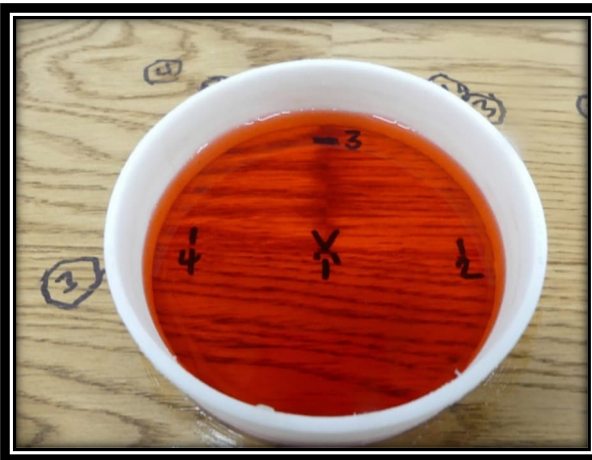
After 24 hrs With Water