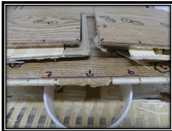
Recovered Swell (Disassembled)

"THIS REPORT APPLIES ONLY TO THE SAMPLES TESTED" Samples and their identifying descriptions have been provided by the client unless otherwise stated. NZWTA Ltd makes no warranty, implied or otherwise as to the source of the tested samples. The above results are designed to provide THE CLIENT WITH GUIDANCE INFORMATION ONLY. This document shall not be reproduced except in full.