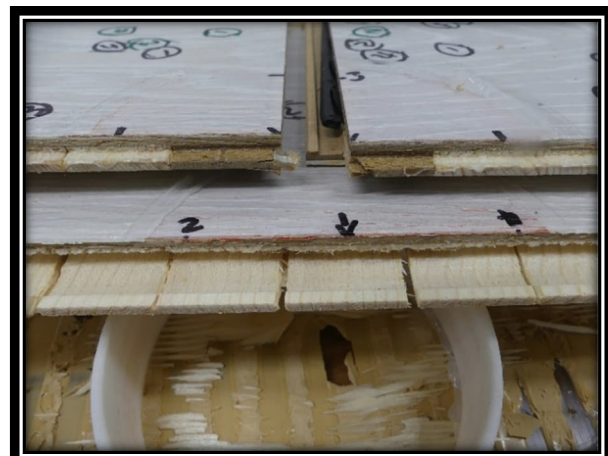
Recovered Swell (Disassembled)

"THIS REPORT APPLIES ONLY TO THE SAMPLES TESTED"