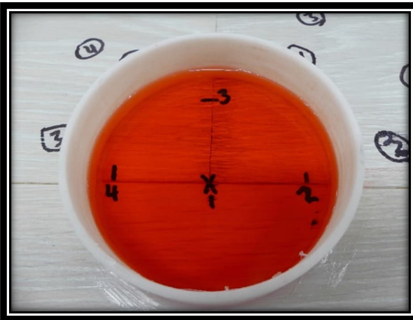
After 24 hrs With Water