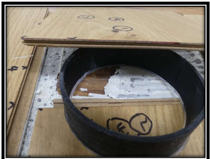
Recovered Swell (Disassembled)