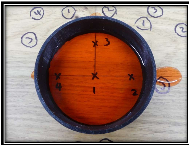
24 Hrs with Water