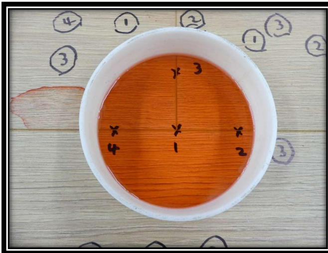
After 24 hrs With Water