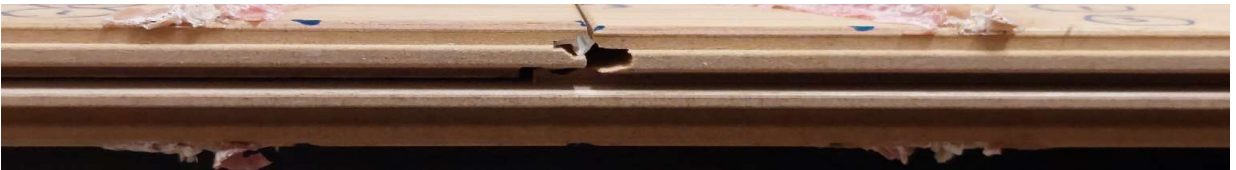
Figure 3 - Photo of sample 2 after disassembly