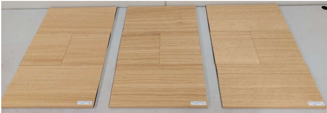
Figure 1: Flooring samples as supplied

Note: The samples were assembled at SGS office by the client.