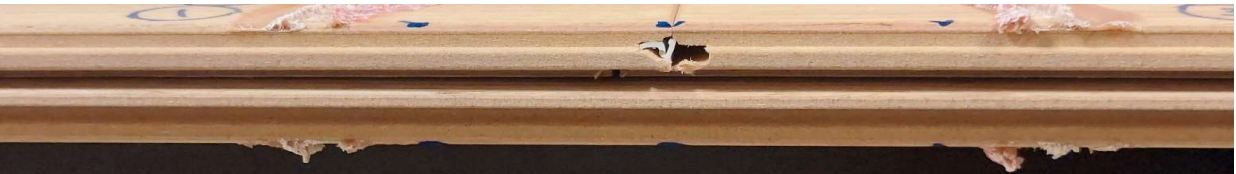
Figure 4 - Photo of sample 3 after disassembly