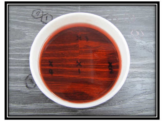
24 Hrs with Water